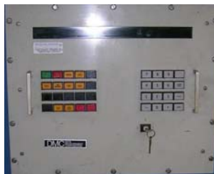
this obsolete pushbutton DMC can now be upgraded to...

We are pleased to announce that we now have the ability to upgrade the DMC-410, DMC-450, and the RM-206. Having been thoroughly tested in house for several months, our first DMC upgrade gauge will be in the field soon!